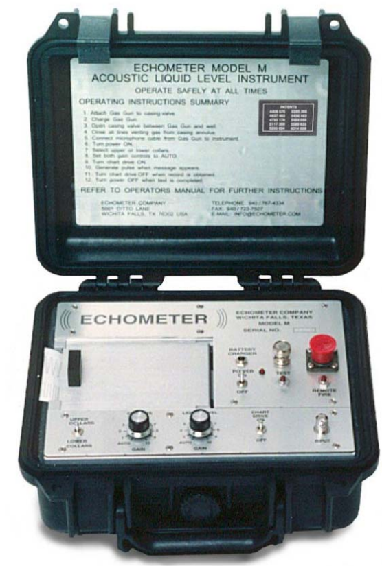
WORLD'S MOST POPULAR LIQUID LEVEL INSTRUMENT

Phone (940) 767-4334 Fax (940) 723-7507 E-Mail info@echometer.com www.echometer.com